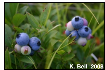
K. Bell 2008