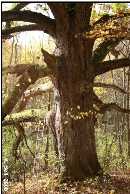
K. Bell 2008