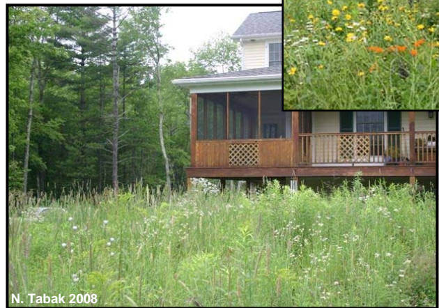
N. Tabak 2008